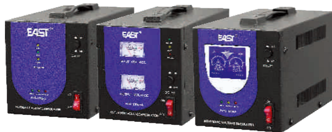
500VA ~ 5000VA

AVR series AC automatic regulators apply the advanced control technology with well qualified components. It has the features of wide input voltage compatibility, high reliability, output voltage stabilizing, energy saving etc.; it has over voltage and low voltage protection and delayed output protection etc.. it could supply stabilized power to lights, TVs, air-conditioners, refrigerator, computers and duplicating machines and other household equipment in schools, offices, hotels, meeting rooms where the stabilized voltage is needed.