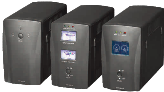
500VA ~ 1000VA